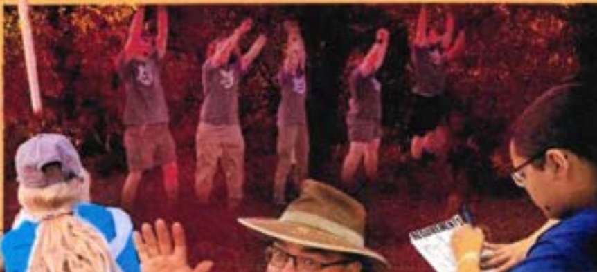
Friday Family Night