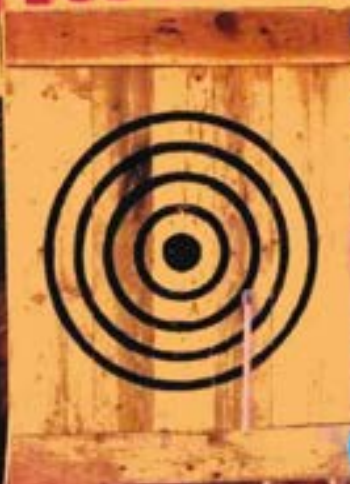
Tomahawk / Knife Throwing