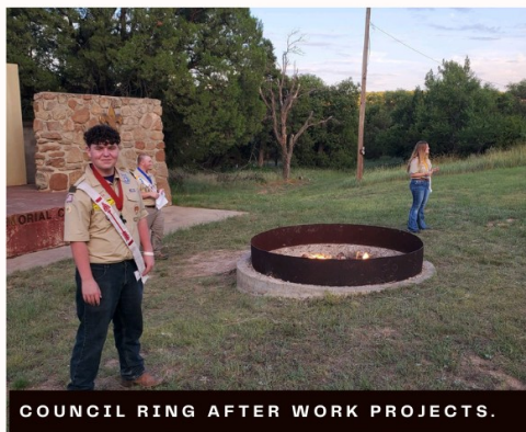
COUNCIL RING AFTER WORK PROJECTS.