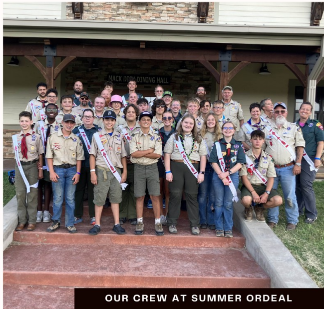
OUR CREW AT SUMMER ORDEAL

At Summer Ordeal, members and candidates gathered at Camp Don Harrington for a weekend of service and fellowship. Projects included cleaning up lumber and trash around camp, setting up PVC pipe stands for the upcoming Sporting Clays weekend, and improving the council ring by cleaning the area and installing the propane tank safely in the ground.