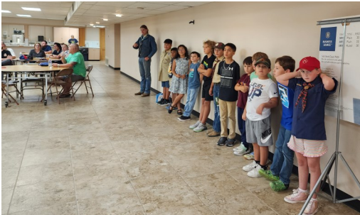
Pack 163 having their pack meeting and then Troops 163 and 4163 hold their Court of Honor!