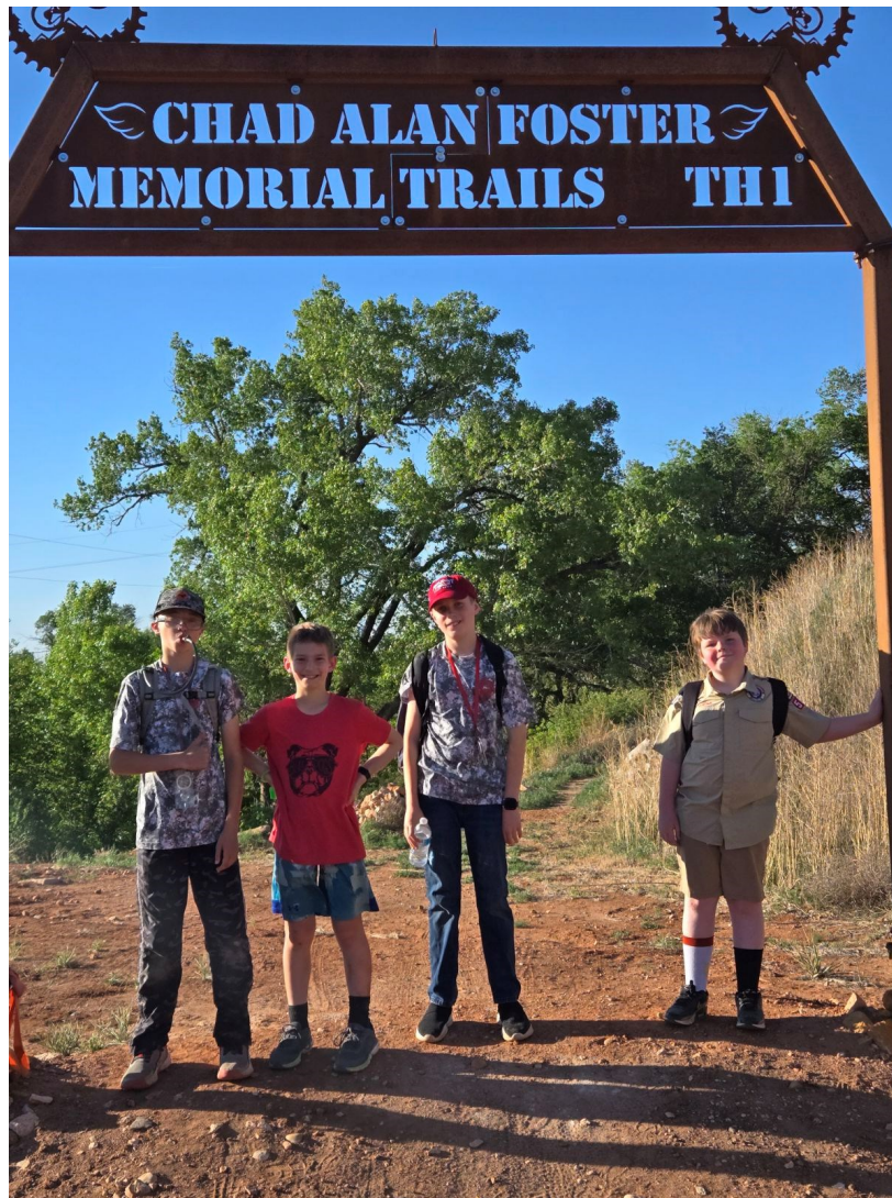
Troop 548 and Pack 548 went hiking on the Chad Alan Foster Trails in Borger.

Roundtable is 1st Thursday of the month ZOOM .