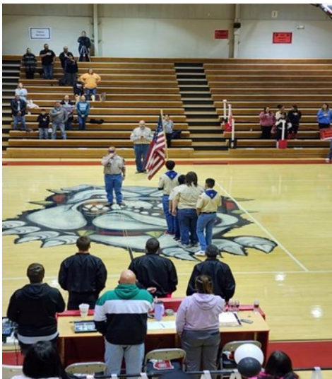
Troop 565 in Borger posted the colors for a Basketball Game and also did some community service!

Roundtable/District meeting combined: 1st Thursday of the month – 6:30 pm at First United Methodist, 201 E Foster, Pampa, TX