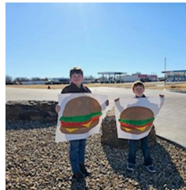
Pack 423 in Pampa has a fundraiser!