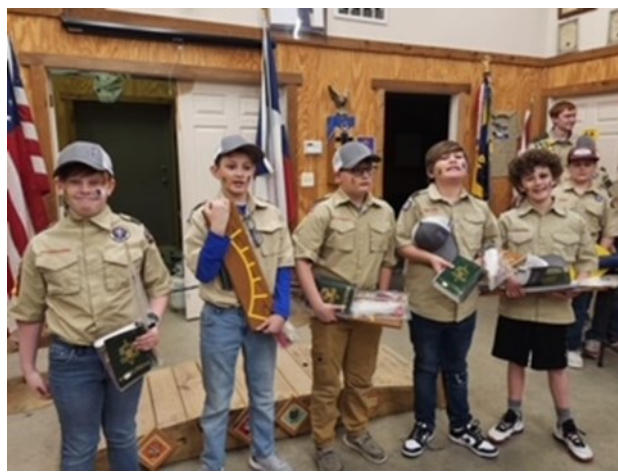
Boy Scout Troop 501 in Panhandle accepts new Scouts in their Troop!