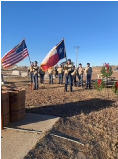
Troop 472 posted the Colors and placed wreaths at the cemetery for Veterans.