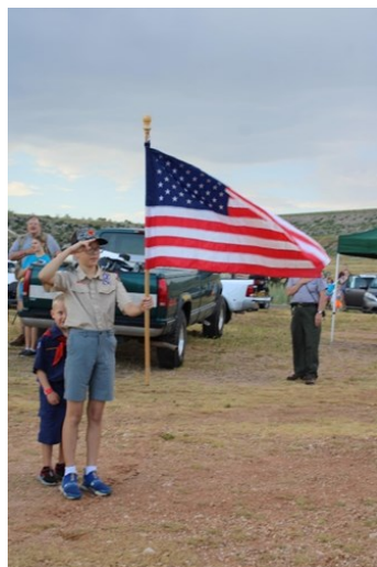
Color Guards at a recent event in Fritch Troop 548 and Pack 548