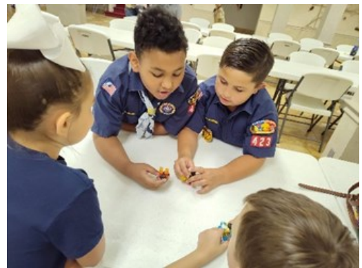
Scout Friends, Pack 423, Pampa