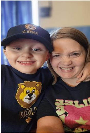
Mama and her Lion Pack 548, Fritch

Roundtable/District meeting combined: 1st Thursday of the month – 6:30 pm at First United Methodist, 201 E Foster, Pampa, TX