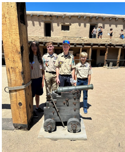
Troop 548 at Bent's Fort near La Junta, Colorado

Roundtable/District meeting combined: 1st Thursday of the month – 6:30 pm at First United Methodist, 201 E Foster, Pampa, TX