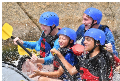
Troop 548 rafting on the Arkansas River near Buena Vista, Colorado!