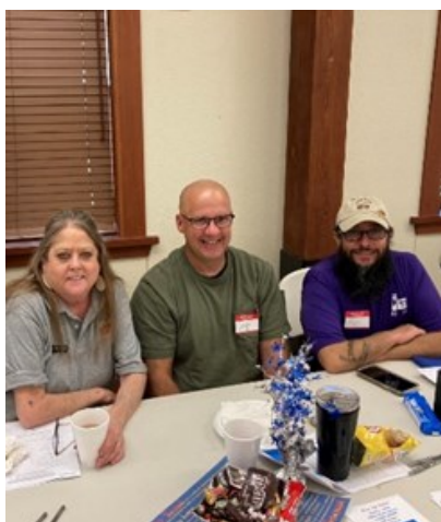
Adobe Walls Key 3