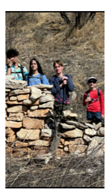
Fritch Troop 548 hikes out to an old Indian Lodge and Trappers Cabin.