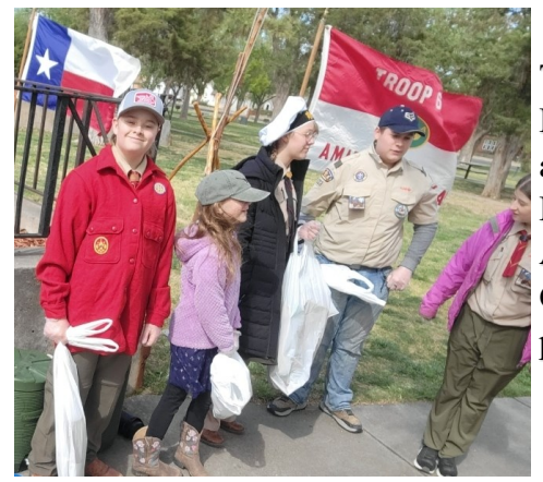
Troop 633, 4633 and Pack 54 all participated in a clean up at Memorial Park assisting the Amarillo West Rotary Club with their service project.

Roundtable: 1st Thursday of every month from August thru June - 7:00 pm at the Scout Office