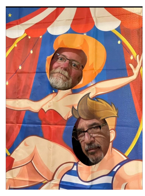
NOAC 2024 – Boulder, Colorado – Colorado School of Mines – Stay tuned for more info as we develop plans for a Lodge Contingent!