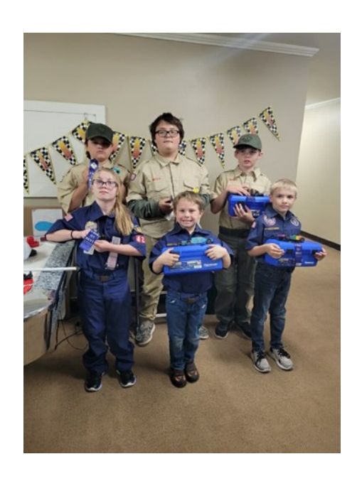
Mclean Pack and Troop 425 enjoy Pinewood Derby!