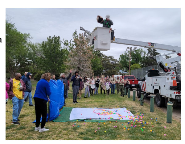
They also had a ping pong ball fundraiser and homemade gourmet pizza for lunch!