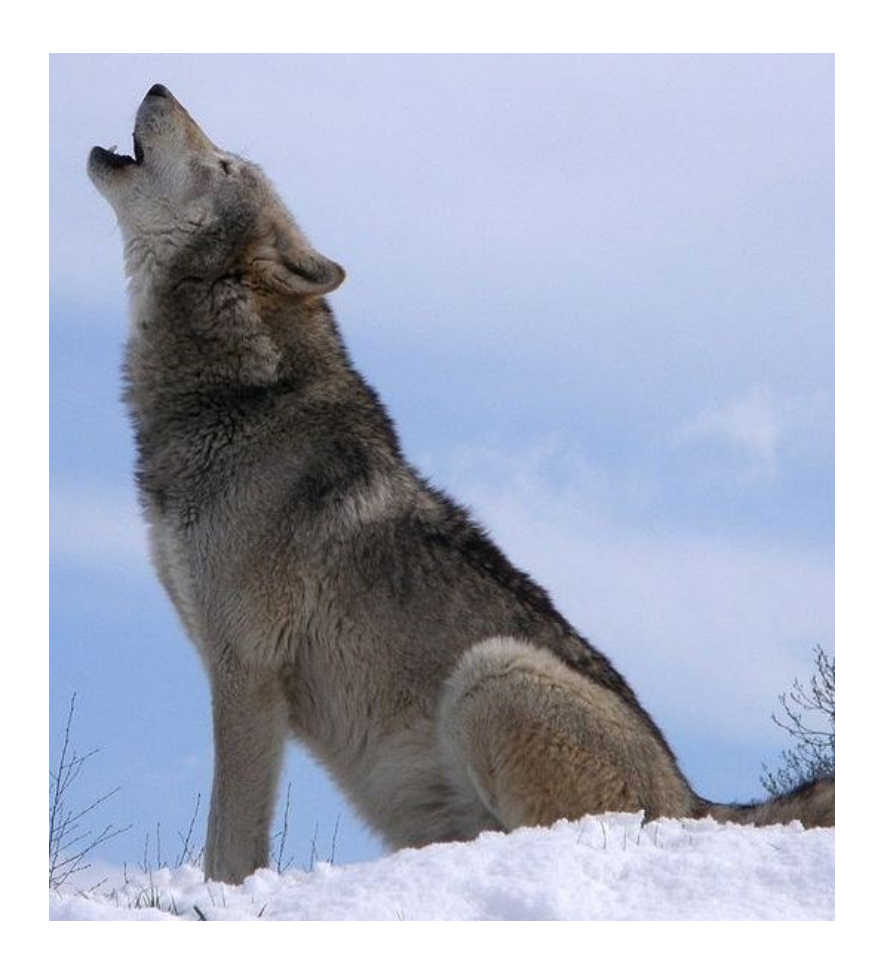
Come Visit the Lone Wolf District!