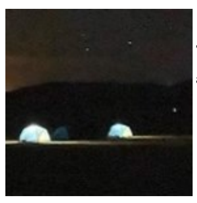
Troop 4086 camping under the stars at Lake Meredith