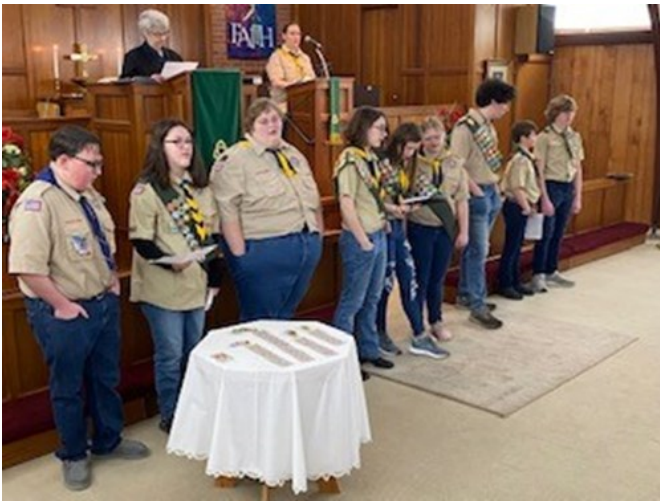
Pampa Troop 0413 and 4413 hold a Court of Honor on Scout Sunday.

Roundtable/District meeting combined: 1st Thursday of the month – 6:30 pm at First United Methodist, 201 E Foster, Pampa, TX