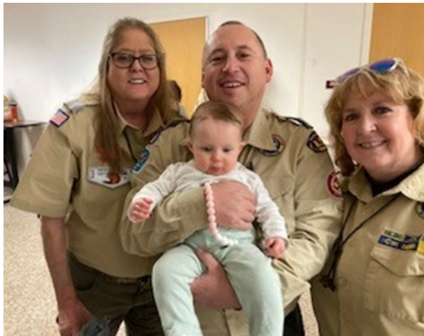
Golden Spread Council's 3 District Executives and a baby!