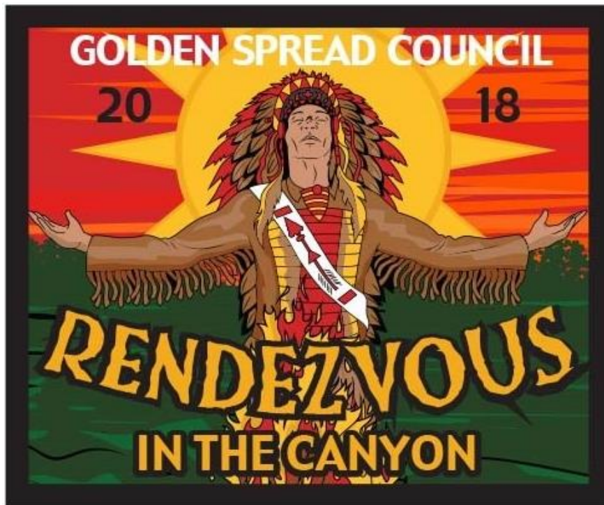
2018 Camporee Patch

Each participating Troop will receive a Camporee Participation Ribbon and Patch, see below. In addition, there will be 1 st , 2 nd , and 3 rd place ribbons for each event, a ribbon for the Patrol who demonstrated the most Scout spirit throughout the competition, and an award for the overall winner.