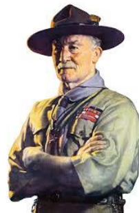
Lord Baden Powell

Please look at all the details about this Program on page 19- we are sure your Scouts would love to learn about it and join in the fun!!!!