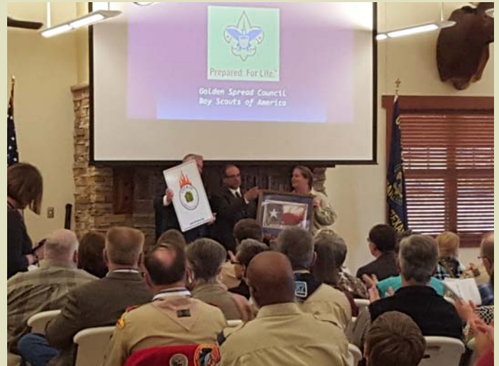
Our Scout Executive and Assistant Scout Executive accepting the Fire Wise Community Designation Signs from the Texas Forest Service