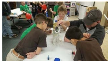
Pack 21 Learning about science