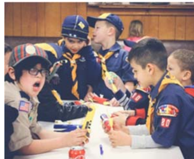
Pack 80 Space Derby

Clara Carpenter <clara.carpenter@sprouselaw.com>