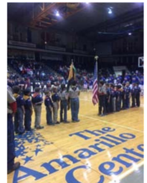
Pack 21 Flag Ceremony for Harlem Globetrotters